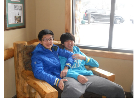
The students eagerly wait to check into their rooms