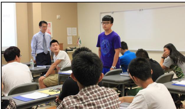
Welcome Meeting at the New Student Orientation

Students attending the first session were treated to the movie, Teenage Mutant Ninja Turtles at a nearby movie theater. RH would like to thank the New Castle County 4-H Office for allowing the use of their conference room for the Orientation programs.