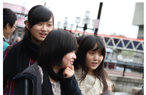
The students wonderful time on the inner Harbor