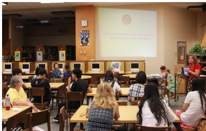
Learning about high school in the U.S.