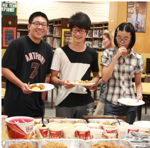
Lunchtime-American Fast Food!