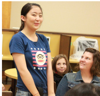
Time for Introductions