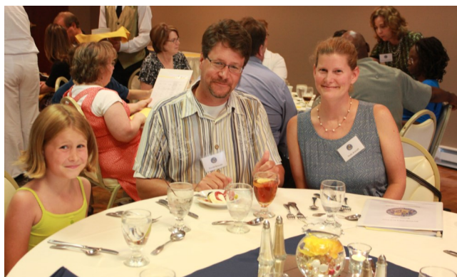
The Arcscott Family